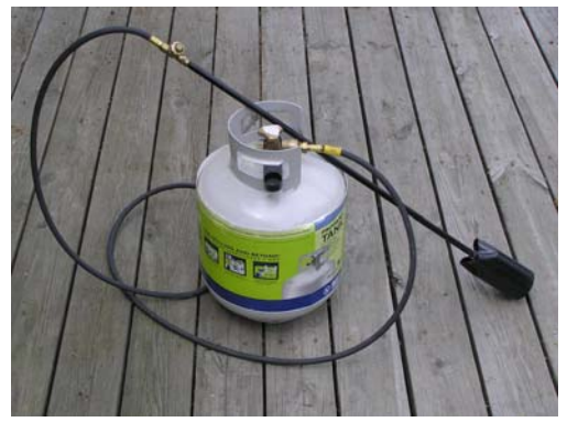
Weed-burner Propane Tank Rig

When the next bee nest appeared, I tried something different. I hooked up a weed-burner (long metal rod with a barrel on one end and valve on the other end – see figure below) to a gas-grill propane tank.