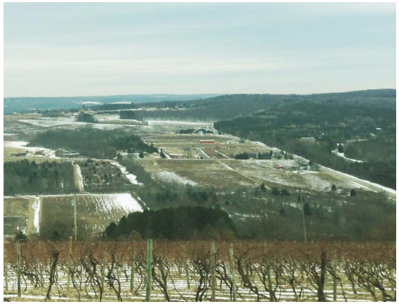
The hills around the Keuka Lake Watershed provide prime soils for agriculture

Practices like establishing stream setbacks for grazing areas, planting buffer vegetation next to streams and limiting the use of pesticides can ensure that agriculture does not reduce the water quality of the lake, groundwater in the area or other waterways in the watershed. State and local policies can help to preserve and improve agriculture.